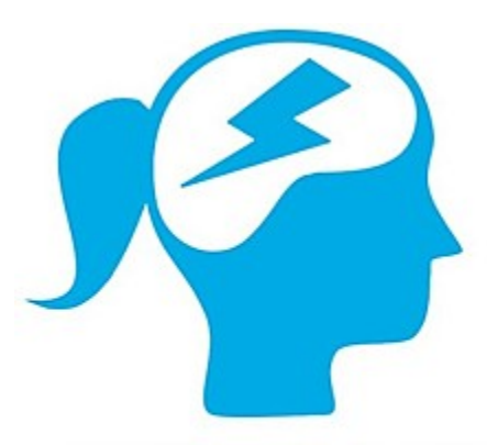
"Plugged" activities are things that everyone does in front of their computers with their eyes on the screen.